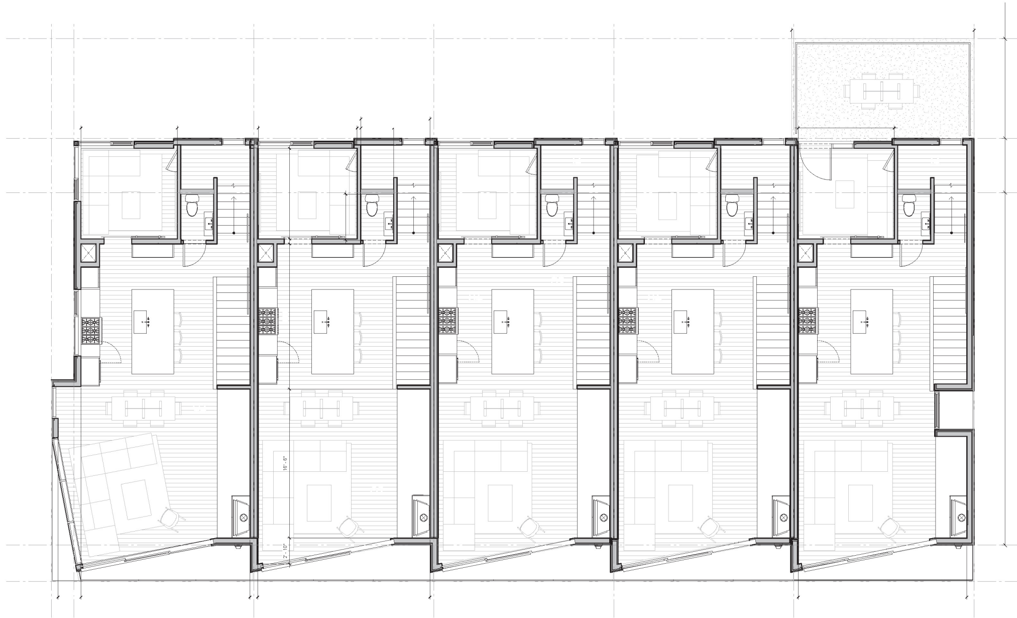
FLOOR PLAN - LEVEL 02